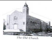
The Old Church

Date: Sat. Oct. 4th. Time: 11:00 am to 4:00 pm. Place: Parking Lot (rain or shine). Cost: $10 adults, $3 children-under 6 free. Tickets are on sale in the vestibule of the church. Tickets sold at the event will cost $15 and $5 for children. VOLUNTEERS NEEDED! Meeting for all volunteers will be held on Sept. 17 th at 7:30 pm in our gym.